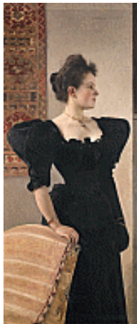
Portrait of a Woman, c. 1893

Klimt adopted the photographic realism demonstrated by this painting only for a brief period around the mid-1890s, mainly in his decorative schemes for buildings and in his early portraits. This large female portrait is an impressive example from this stylistic phase. Every detail has been rendered with a meticulous perfection akin to a miniature. Klimt probably used a photograph as a resource for this work.