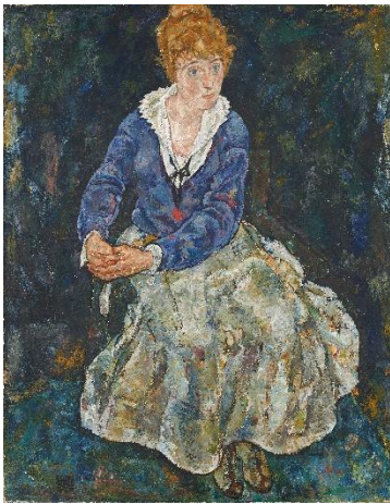
Portrait of the Artist's Wife, Edith Schiele, 1918

In June 1915, Egon Schiele married Edith Harms who was from a bourgeois family and three years his junior. Their different backgrounds and values made it difficult for her to adapt to her husband's artistic world. As time went on, however, she grew accustomed to this bohemian scene. Edith and Egon loved each other deeply and their affection is expressed in their letters. Schiele captured his wife's features in many drawings and two paintings. She always looks soulful, soft and sensitive, qualities Schiele obviously cherished.