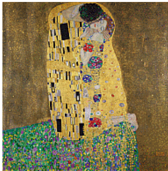
This Kiss (Lovers), 1908/09

The Kiss (Lovers) by Gustav Klimt is the most famous Austrian painting in the world and the highlight of the permanent displays at the Upper Belvedere. A couple, swathed in richly adorned robes, tenderly embrace on a luxuriant flowery meadow. It was painted in 1908/09 at the height of Klimt's "Golden Period." At this time, the artist developed his new technique of combining gold leaf with oils and bronze paint. Klimt's Kiss presents a universally valid allegorical message from the early twentieth century about love being central to human existence. The fact that the picture still has an immediacy and emotional impact demonstrates the brilliance of his achievement. The garments of the lovers are embellished with gold leaf and the background, too, is suffused with delicate gold, silver, and platinum flakes. It was acquired by the Austrian state for the recently founded Moderne Galerie at the Lower Belvedere at its first presentation in 1908. The painting has been in the museum's collection ever since.