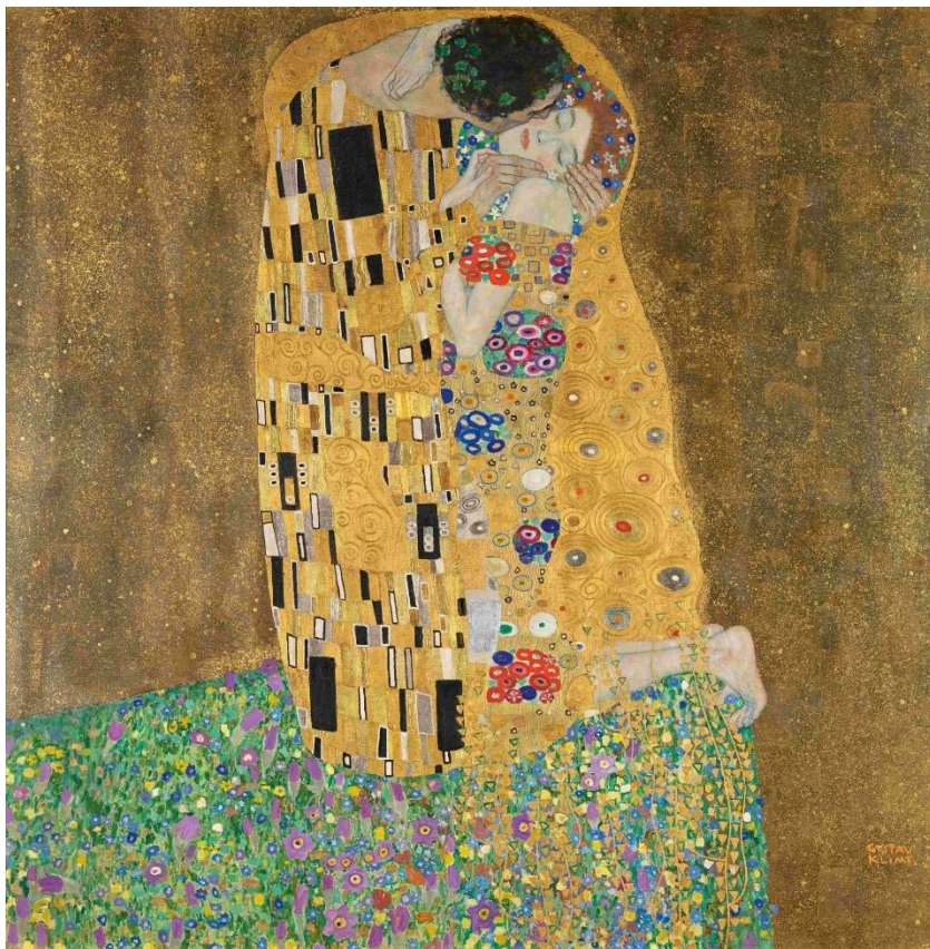
Gustav Klimt, The Kiss (Lovers) , 1908 (finished 1909)