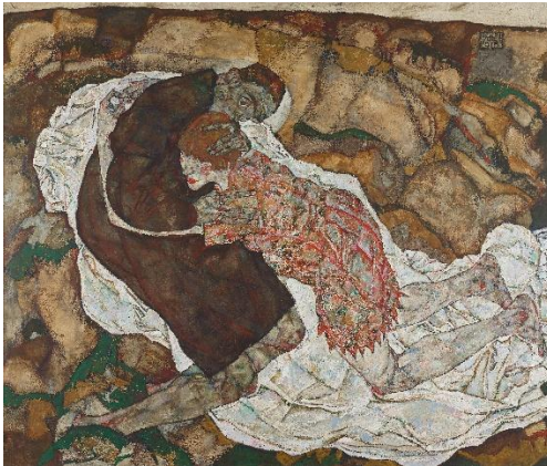
Death and Maiden, 1915

Schiele painted this picture in 1915 when he was breaking up with Wally Neuzil after a long relationship. Wally had worked for Schiele as a model and they had soon started a love affair. But he left Wally in the spring of 1915 in order to marry Edith Harms in June of that year. He certainly did not find the separation easy, however, as he documented in this painting. Beyond its biographical background, this work can be seen as a universally valid allegory about parting, love, and death.