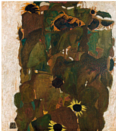
Sunflowers I, 1911

For Schiele, sunflowers were a recurring theme, especially in his early work. Probably they were inspired by Vincent van Gogh's famous sunflowers that could be seen at Secession exhibitions and at commercial art galleries in Vienna. As in van Gogh's paintings, the flowers also have a psychological aura in Schiele's work, for it seems that he was essentially aiming to depict people. This effect can be found in many other depictions of flowers and trees by the young Expressionist.