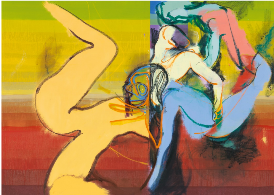
Daniel Richter, Bill, 2015, Private Collection, Rotterdam, Courtesy Galerie Thaddeus Ropac, London – Paris – Salzburg