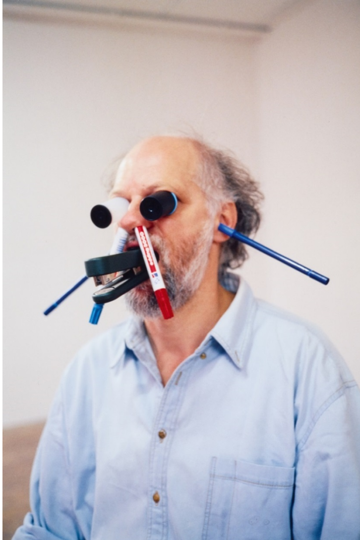
Erwin Wurm, One Minute Sculpture , 1997/2005, Belvedere, Vienna